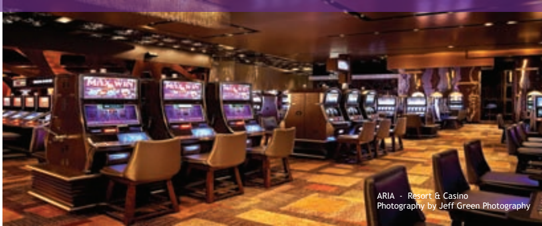
ARIA - Resort & Casino