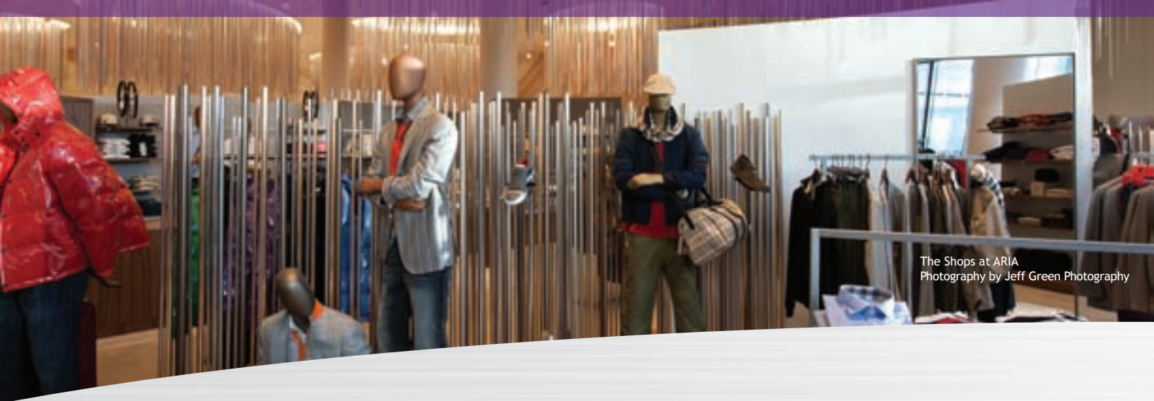
The Shops at ARIA

Flexible • Collaborative • Transformative • Solutions