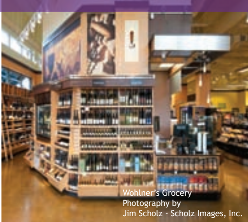
Wohlner's Grocery