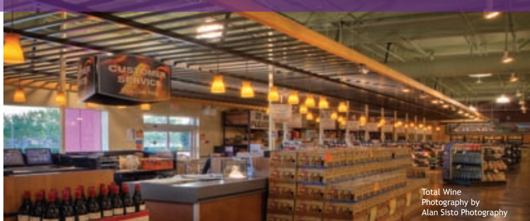
Total Wine