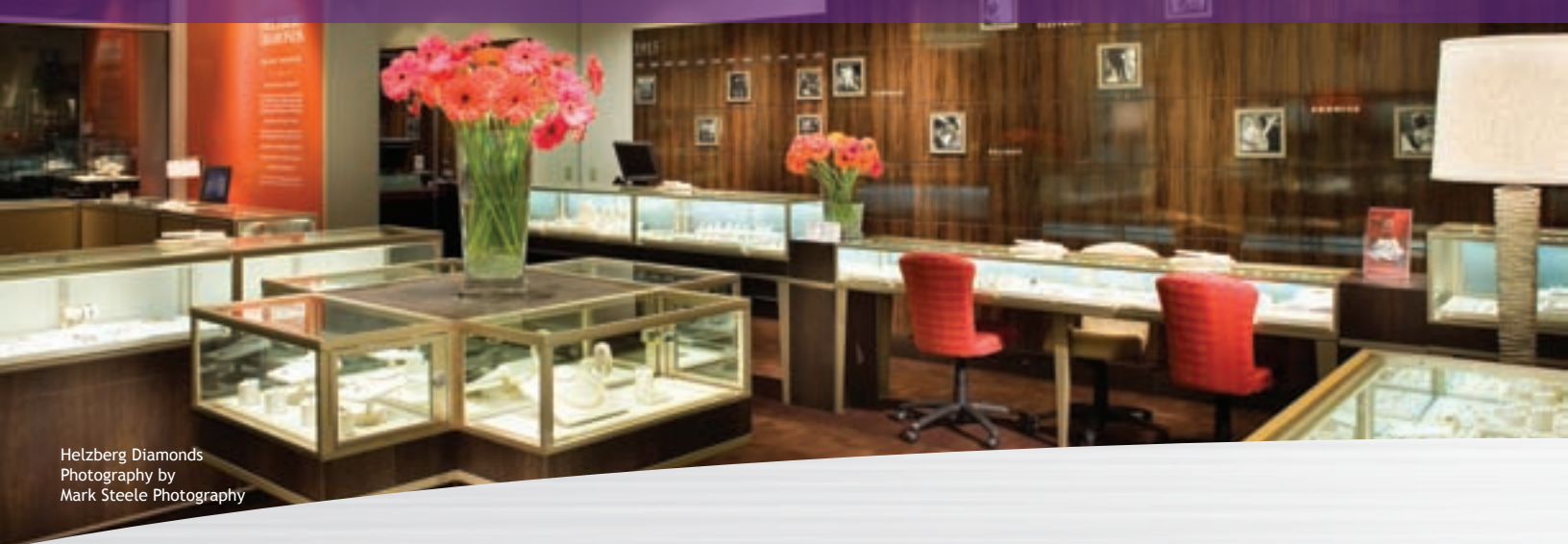
Helzberg Diamonds

Flexible • Collaborative • Transformative • Solutions