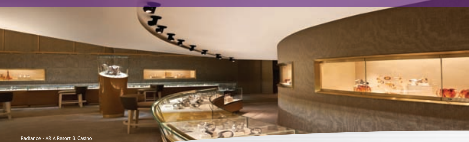
Radiance - ARIA Resort & Casino

Flexible • Collaborative • Transformative • Solutions